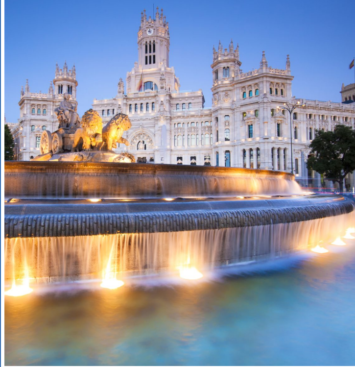
PLAZA DE CIBELES, MADRID

Madrid Extension: $949 Double Occupancy or $1,269 Single